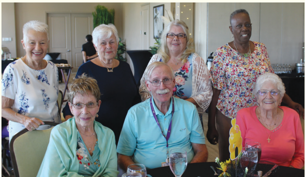
Thank you to all Parrish Healthcare volunteers!

Please visit parrishhealthcare.com/volunteer or email volunteerservices@parrishmed.com to learn more about volunteering at Parrish Healthcare